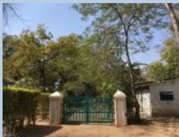
Meherazad Gate, India